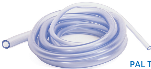
PAL Tubing | PAL-1200 Length 12 ft. (3.66 m)